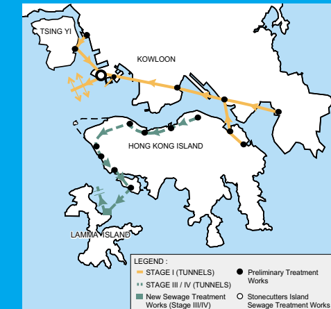
Option B : Treatment at Stonecutters Island and Lamma Island