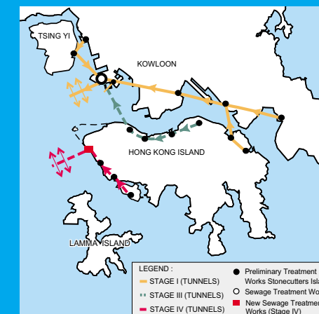
Option C : Treatment at Stonecutters Island and Sandy Bay